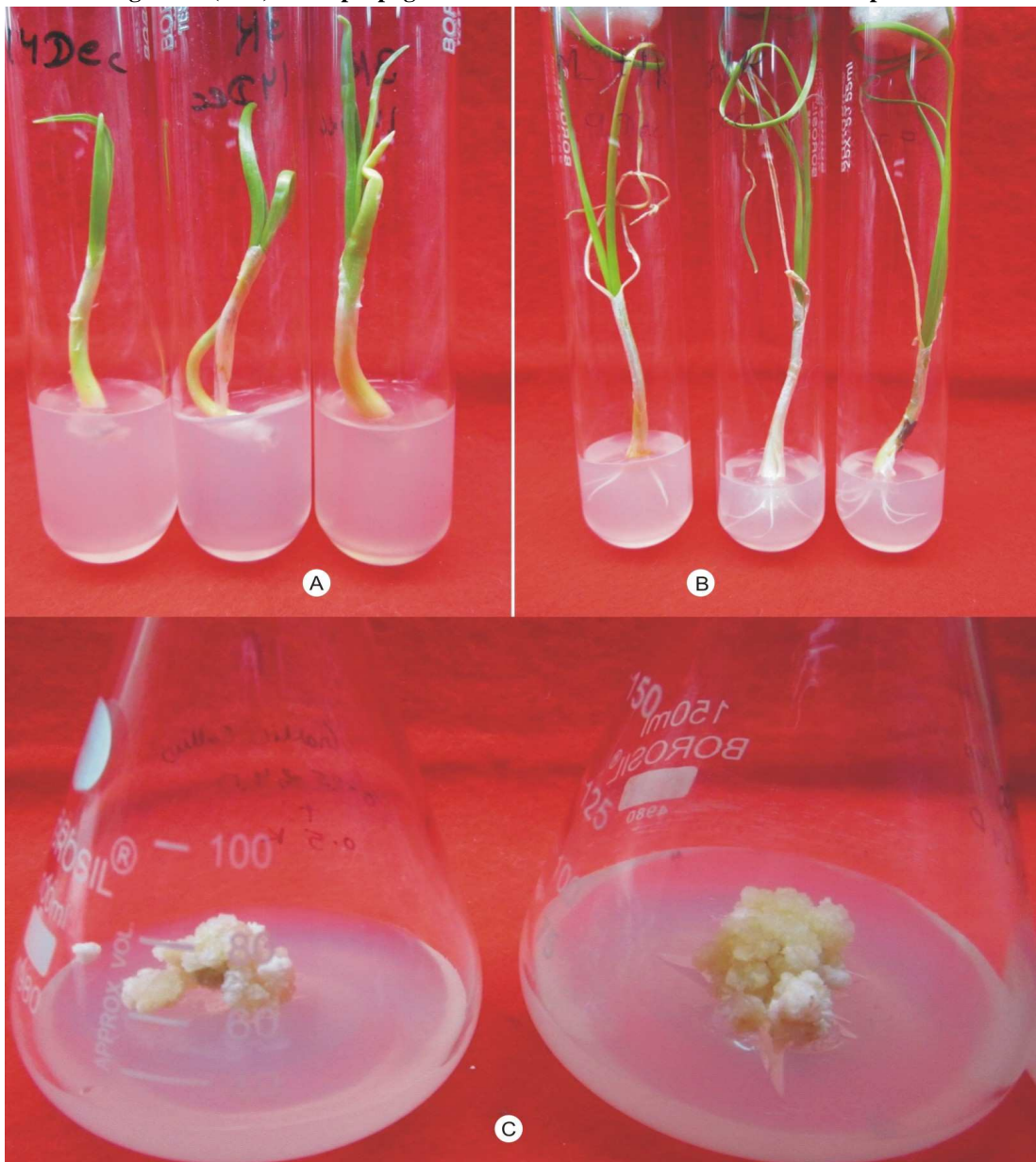
Figure-1: (A-C) Micropropagation of Allium sativum from nodal shoot explants

A. Shoot multiplication on MS medium supplemented with 1.0 mg/l Kn, B. Root multiplication on MS medium supplemented with 1.0 mg/l IBA, C. Callus induction from leaf on MS medium supplemented with 0.25 mg/l 2,4-D +0.5 mg/l Kn, & Callus induction from leaf petiole on MS medium supplemented with 0.25 mg/l 2,4-D +0.5 mg/l BAP.